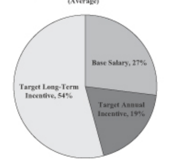
Total Direct Compensation Mix - Other Named Executive Officers (Average)